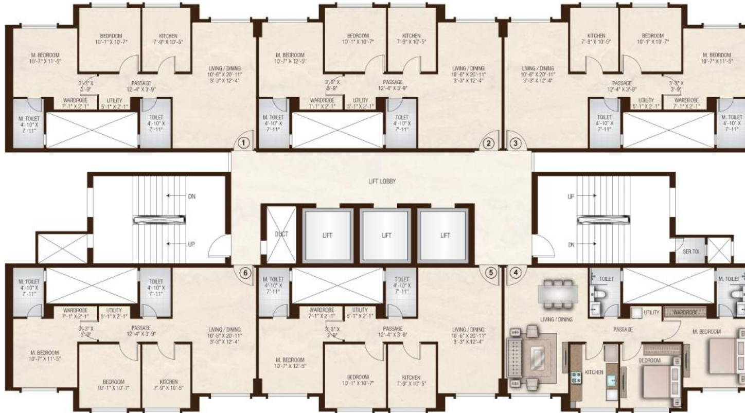
Carpet Area Statement