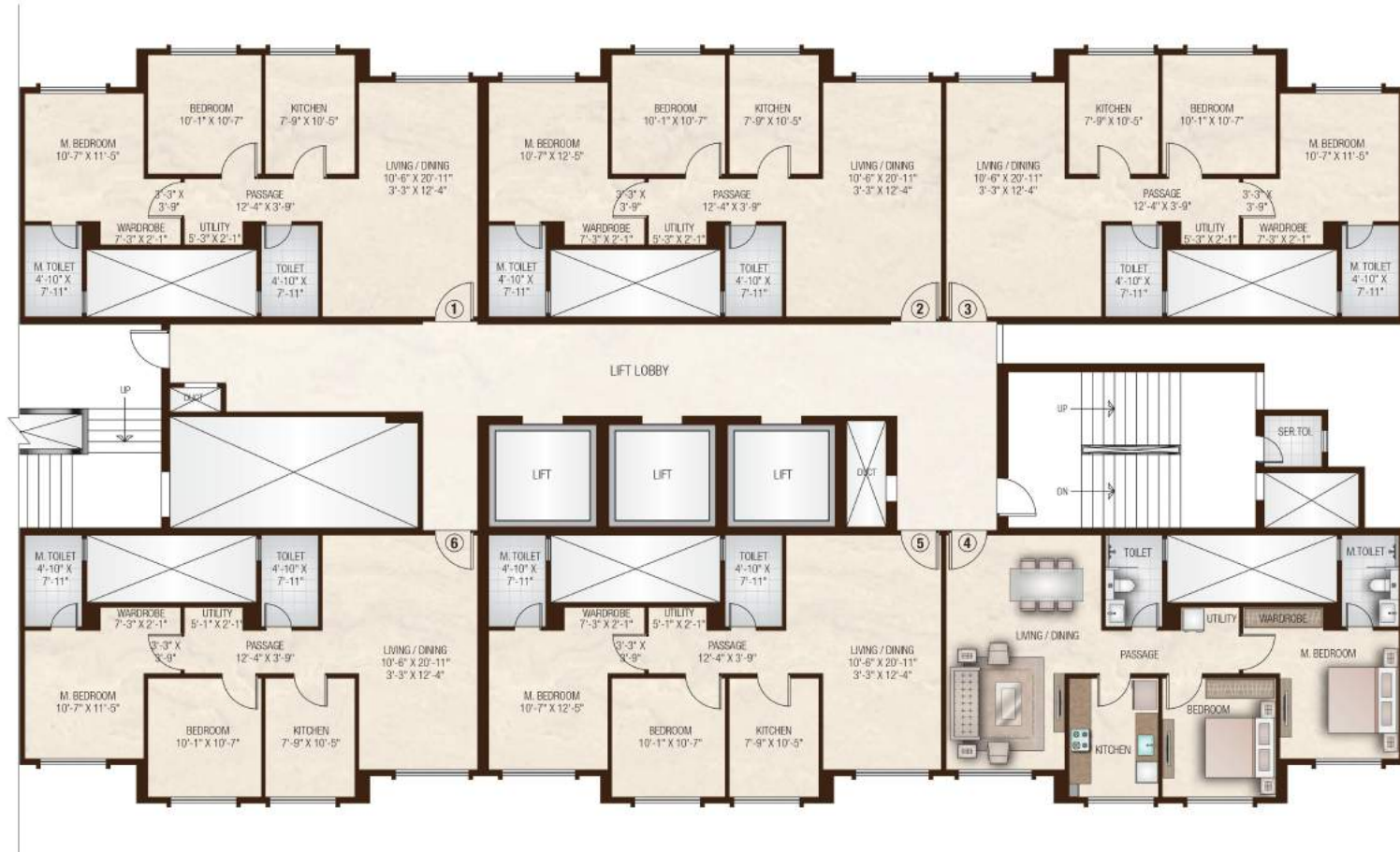
Carpet Area Statement